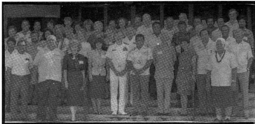
MEETING ON HEALTH HELD IN FSM - A group photo of the Pacific Region Officials who met in the FSM to discussed health and its services in the Pacific.