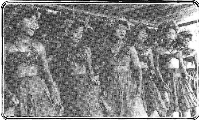
CULTURAL DAY IN POHNPEI - Above are girls from Pohnpei dancing during the Pohnpei Cultural Day on Marach 31, 1993 at the Spanish Wall Park. The Day began with floats from all municipalities especially the headstarts centers. At the park after the remarks were dances and other presentation of cultural and custom activities. Madolenihmw celebrated Cultural Day in Madolenihmw on the same day with presentation of Pohnpeian dances and other cultural and custom and activities.