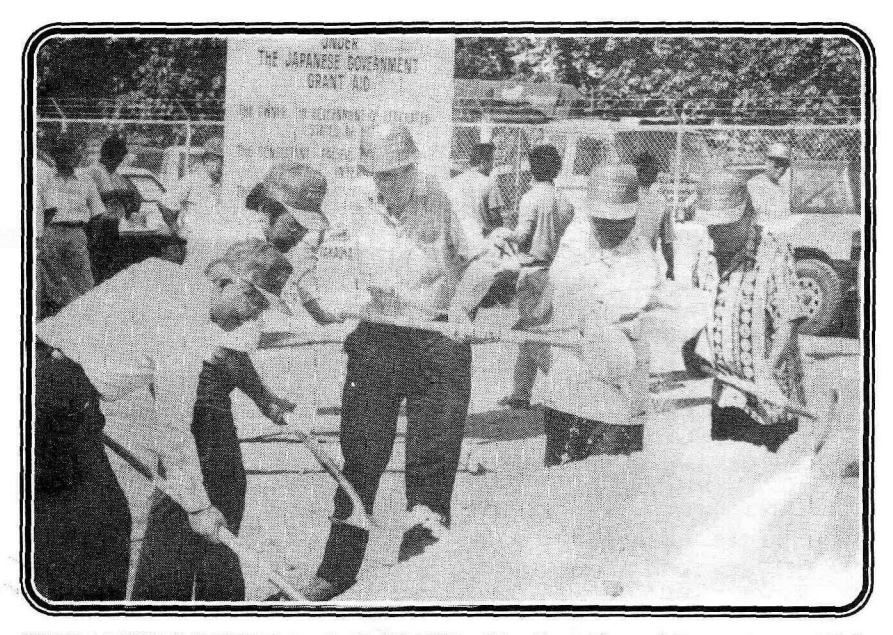
UPGRADING POHNPEI POWER PLANT - The Nanpohnmal Power Plant will be upgraded after the ground breaking ceremony held, April 12 which will provide an additional five mega watts of power. The project is expected to be completed in 11 months and will cost 8.5 million U.S. dollars. Above are the officials representing the Governments of both the FSM and Japan breaking the ground of the project.

Countries wishing to obtain funding to attend the Conference should therefor approach relevant United Nations representatives for further information.