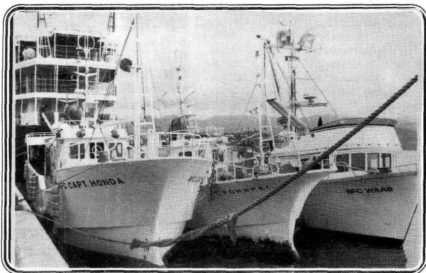
NFC CAPT. HONDA - NFC Capt. Honda (left), was dedicated Feb. 16, 1995, in Pohnpei. It is a semi commercial longline fishing vessel from the Government of Japan to the FSM provided under the 1993 Small Scale Fisheries Grant Aid Program to support NFC's Small Scale Fisheries Development Phase II. The project is a continuation of Phase I which provided two other longline fishing vessels to NFC in 1990, NFC Pohnpei and NFC Chuuk. NFC Waab shown in the photo was purchased with NFC Kosrae from the U.S.