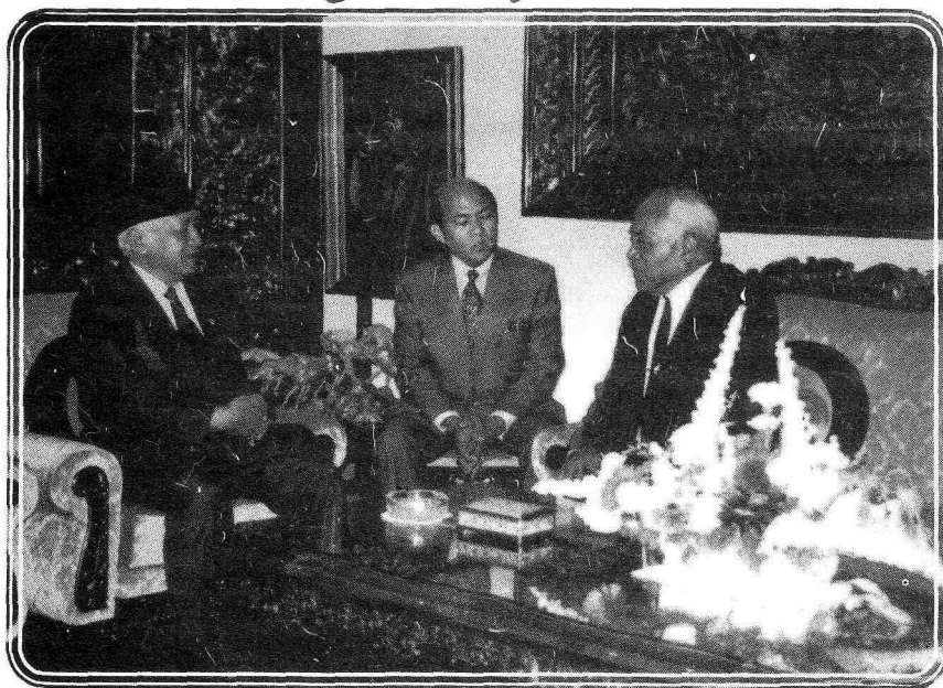
PRESIDENT OLTER VISITS INDONESIA - President Bailey Olter (right) visited Indonesia and had a talk with President Soeharto (left) at the Istana Merdeka. Center is the interpreter. (See Page 3 for story).