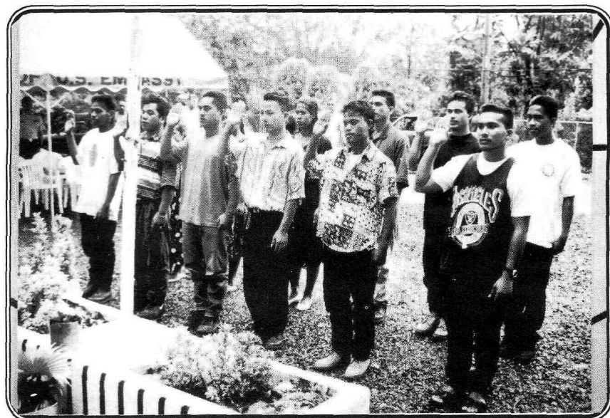
SWEARING-IN - Above are the 1996 U.S. Armed Forces enlistees being sworn-in during a ceremony held at the U.S. Embassy in Konlonia, Pohnpei, June 18, this year.