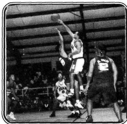
1ST MICRONESIAN TOURNAMENT - Tip off of the championship games between Kosrae and Guam in the first Micronesian Basketball Confederation Tournament held on Kosrae in July this year. Nine Micronesian islands participated in the tournament. Guam won the championship over Kosrae with 02-62. Kosrae came in second and Pohnpei, third.