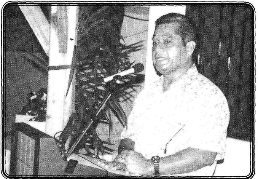
OFFICE OF THE PRESIDENT CHRISTMAS PARTY - Acting President Jacob Nena gave brief remarks during the office Christmas party held December 17, 1996 at the Sky Lite Hotel in Kolonia.

Where activities cannot be directly associated with a specific output, it is not anticipated that these activities will be funded. If the formulated policy and strategic direction considered is in any way deficient and that this deficiency is constraining to the ability to propose a valid output then this should be discussed with Office of Budget in the first instance.