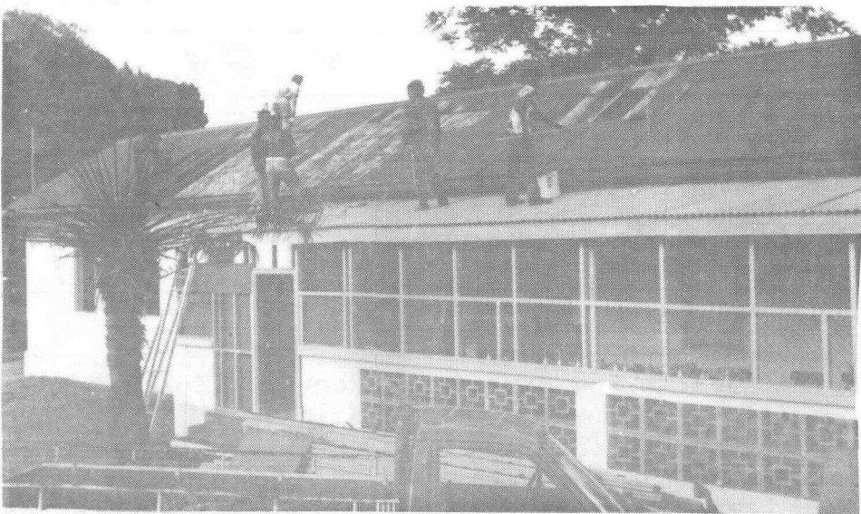
Vanuatu construction trainees upgrading workshop building.