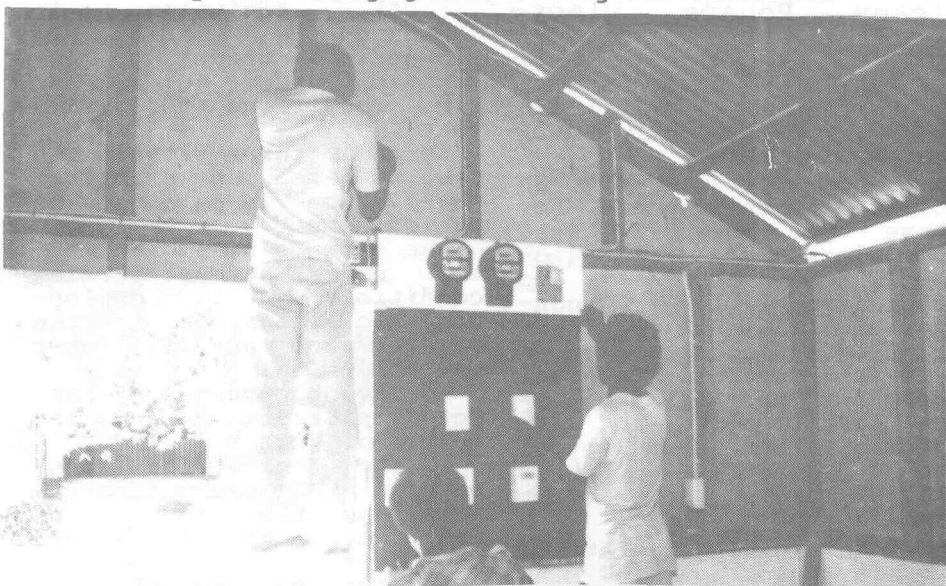
Solomon Islands trainees installing switchboard during Trade Testing instruction.