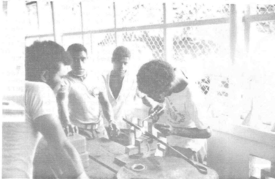
Trainees performing gas welding in Vanuatu.